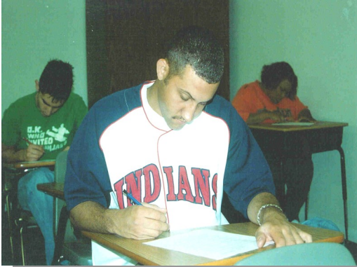
Enter to Learn